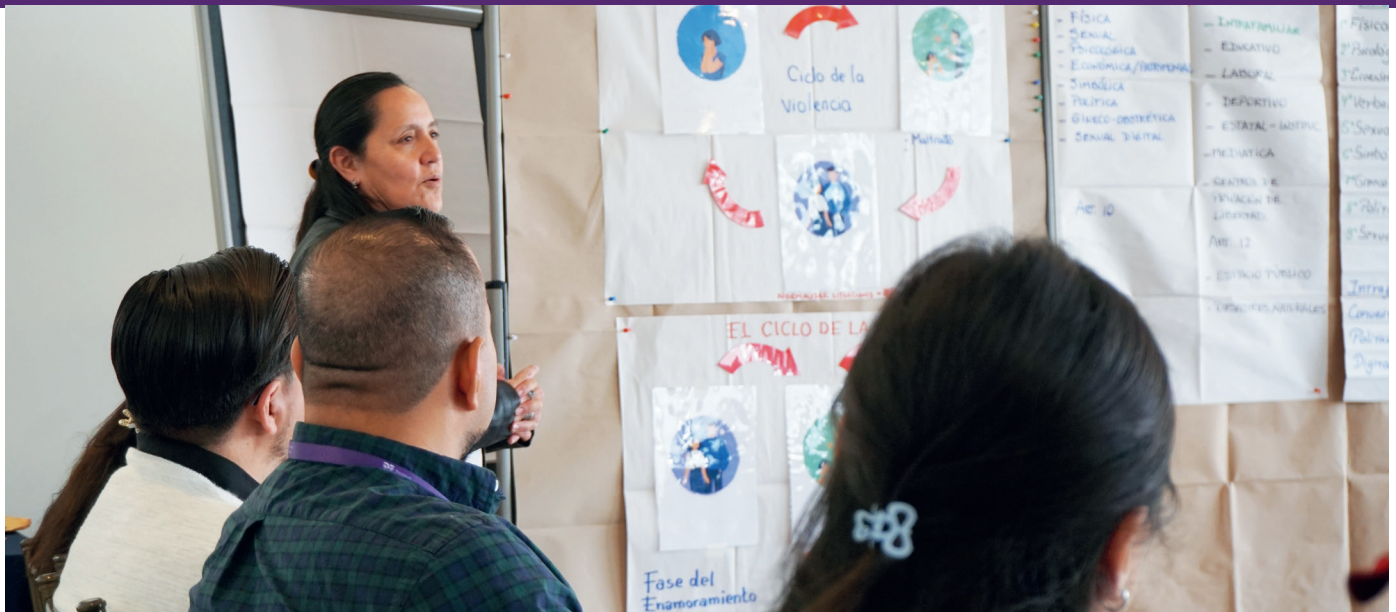
Government Ministry officials improve their skills in preventing violence against women.